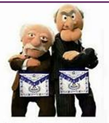
How did you get the Black eye? The wife was giving me a lecture and I corrected her three times.

A Petition for the Valley of Everett Scottish Rite can be found in the newsletter and can be printed and copied